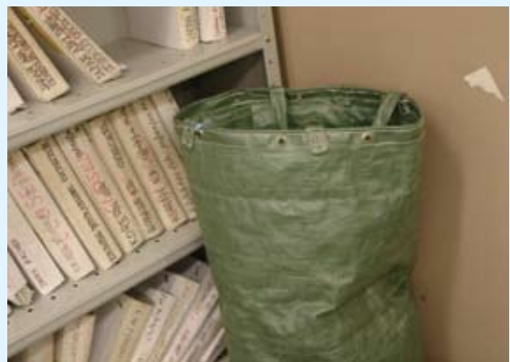
Collection points of waste paper for recycling within the office.