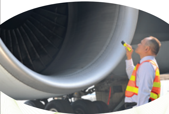
適航主任檢查飛機維修情況。 An Airworthiness Officer examining the maintenance status of an aircraft.