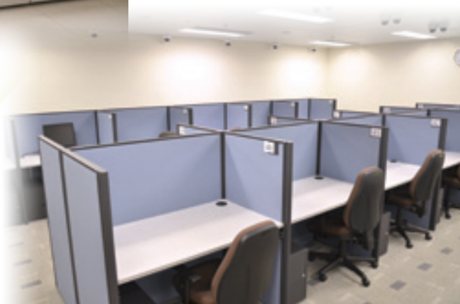
航空人員執照事務組的考試室。 An examination room in PELO.

During the year, PELO processed 2 823 applications, including initial grant and renewal of flight crew licences, aircraft and instrument ratings, language proficiency endorsements and conversion of foreign flight crew licences into Hong Kong licences.