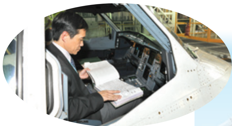
適航主任查閱飛機的維修記錄。 An Airworthiness Officer perusing the maintenance logbook of an aircraft.