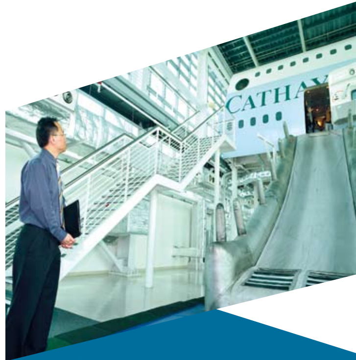
飛行標準組人員到訪航空營運許可證持證公司視察機組人員訓練情況。

Staff of Flight Standards Office inspecting flight crew training of AOC holders.