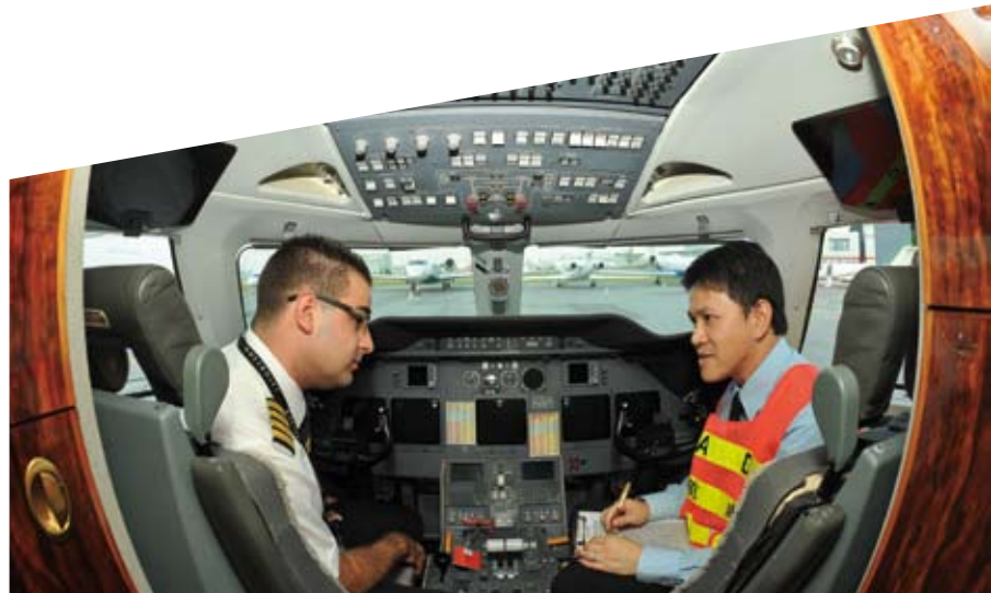
年內，飛行標準組執行了104次飛行檢查。 During the year, the Flight Standards Office conducted 104 flight operations inspections.