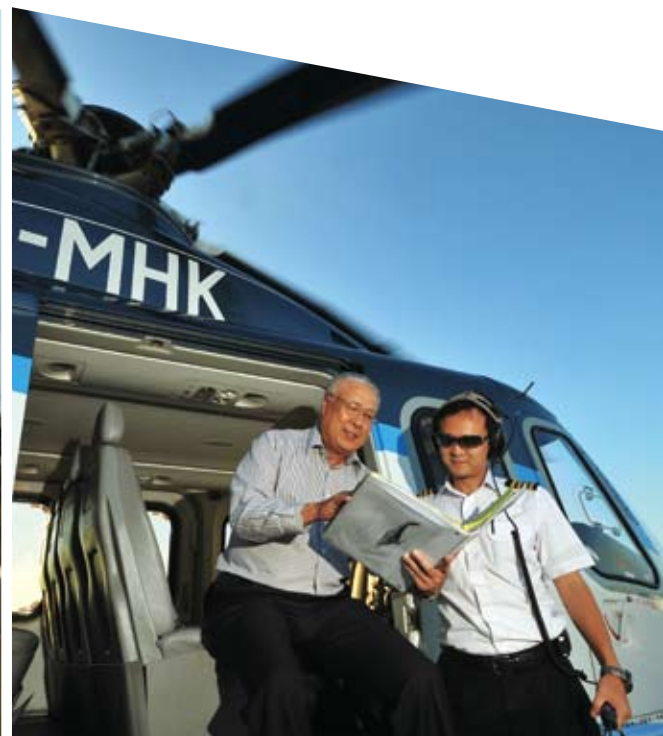
民航處人員巡查直升機營運及機師執照。 CAD officers inspecting helicopter operations and pilot licence.