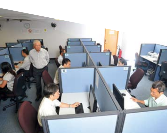
空勤人員執照考試場地。 Venue for conducting flight crew licensing written exam.

Through the reporting of incidents by airline operators and maintenance organisations, safety data collated from the reports were analysed for the purpose of prevention of accident and incident.