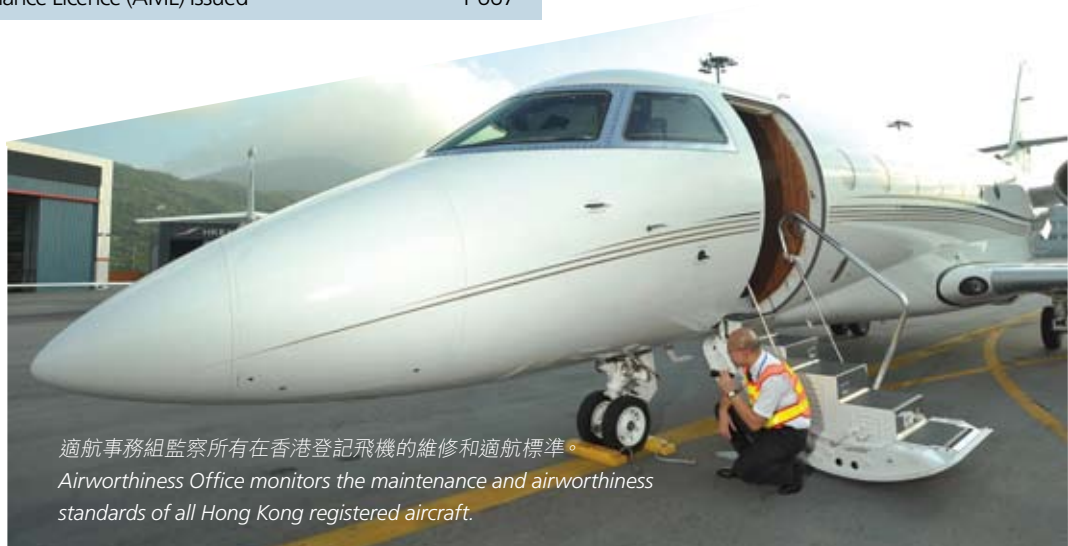
適航事務組監察所有在香港登記飛機的維修和適航標準。 Airworthiness Office monitors the maintenance and airworthiness standards of all Hong Kong registered aircraft.