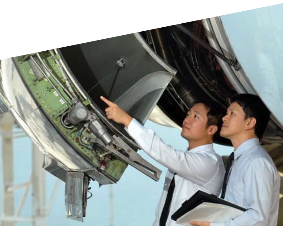
民航處人員進行航機檢查。 CAD officers conducting aircraft inspection.

With Shek Kong airfield the only aerodrome available in Hong Kong for light aircraft operations, PLA continued to give temporary permission to HKAC to operate its recreational fixed-wing and rotary wing aircraft flying and training at the airfield during weekends. GFS was also allowed by PLA to conduct training for its helicopter pilots at the airfield. To ensure flight safety, all these Shek Kong airfield users maintained close liaison and coordination with PLA for their operations at the airfield. The Hong Kong Sector Flight Safety Committee assisted in the coordination if required.