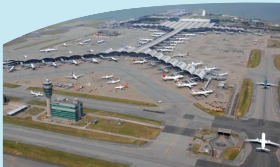
機場雙跑道運作容量自二零零九年三月遞增至每小時57班。 The declared runway capacity for dual runway operations was increased to 57 movements per hour since March 2009.

隨著航空交通管理和空域管理不斷改善，香港國際機場雙跑道運作容量自二零零八年十月起遞增至每小時56班，在二零零九年三月進一步遞增至每小時57班。