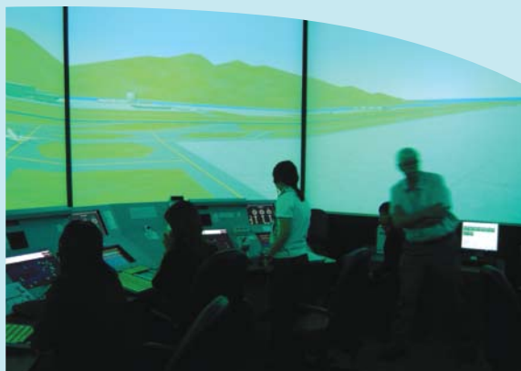
空管人員在控制塔模擬器內接受訓練。 Air Traffic Control staff attending training in the Control Tower Simulator.

為應付預期的交通增長及中長期的人事升遷需求，空管人員的招聘和培訓程式必須審慎管理。由於本地就業市場欠缺符合相關資歷的人才，一般而言，民航處會在本地招聘見習航空交通管制主任(見習空管主任)，經過專門培訓後，再晉升為空管主任。申請人須經過三個甄選步驟——首先是才能測驗的筆試，接著是面試，最後在評估中心進行一系列深入的認知能力及性格評估測試。