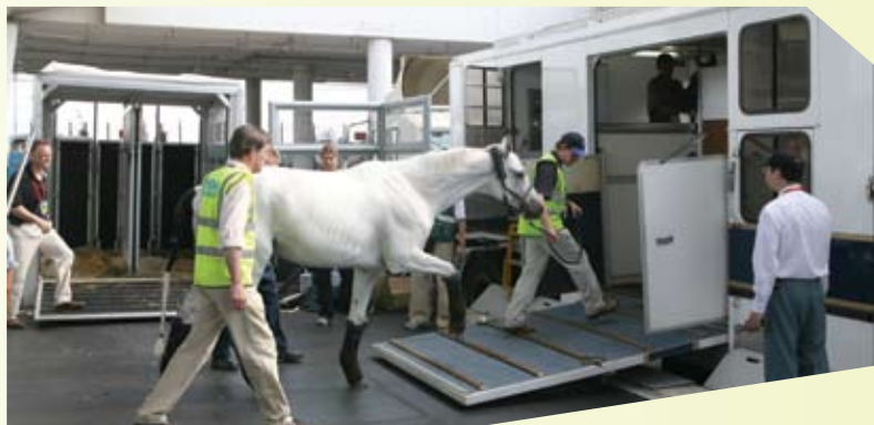
參加馬術賽的馬匹抵達香港國際機場後被帶上運輸車輛，前往沙田賽地的新馬廄。 International horses arrive at Hong Kong International Airport before being shipped to the new stables in the Sha Tin venue.

First Steering Committee Meeting of the ICAO Cooperative Arrangement for Preventing the Spread of Communicable Diseases.