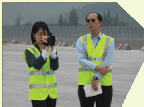
機場安全主任正在一個飛機停機位量度機位闊度。 Airport Safety Officers conducting site measurement of aircraft parking stand.

一如以往，機管局在本年內進行了一系列的維修及提升工程，以提高機場運作的安全和效率。其中一項主要工程是在二零零七年九月至二零零八年四月進行的南跑道刨鋪工程，藉以維護該跑道的廓線。為了更有效率地安排離境飛機包括最大型的A380空中巴士使用南跑道起飛，機管局於二零零七年五月在該跑道西端興建了一條引入式滑行道。此外，為南跑道增建兩條快速出口滑行道以減少降落飛機佔用跑道時間的提升工程，亦已於二零零六年十二月展開，預計於二零零八年七月完工。本部與機管局緊密合作，以分階段型式把現時與南跑道相連的一些快速滑行道更改名稱，以便為這兩條新滑行道於竣工後可順暢地加入運作作好準備。