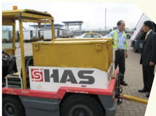
機場安全主任在事故現場調查一宗機場地面事故。 Airport Safety Officer investigating an airport ground incident on site.

年內，本部對機管局進行了14次審計及執行了132次巡察，當中包括飛行區運作，有關飛機運作的機場改善工程、飛行區維修項目、機場工作人員的培訓、安全管理體系的實施及執行救援服務等。為確保香港國際機場在各層面運作上皆符合機場牌照的發牌要求，本部參與機管局對機場特許經營公司所作出的審計。本部亦監察機管局對飛機地面事故的調查工作，確保有關公司採取適當改善措施，以防止同類事故再發生。在監察香港國際機場在貫徹執行安全管理體系方面，本部持續與有關單位評核可接受的安全水平，並繼續監察安全管理體系的執行與提升。