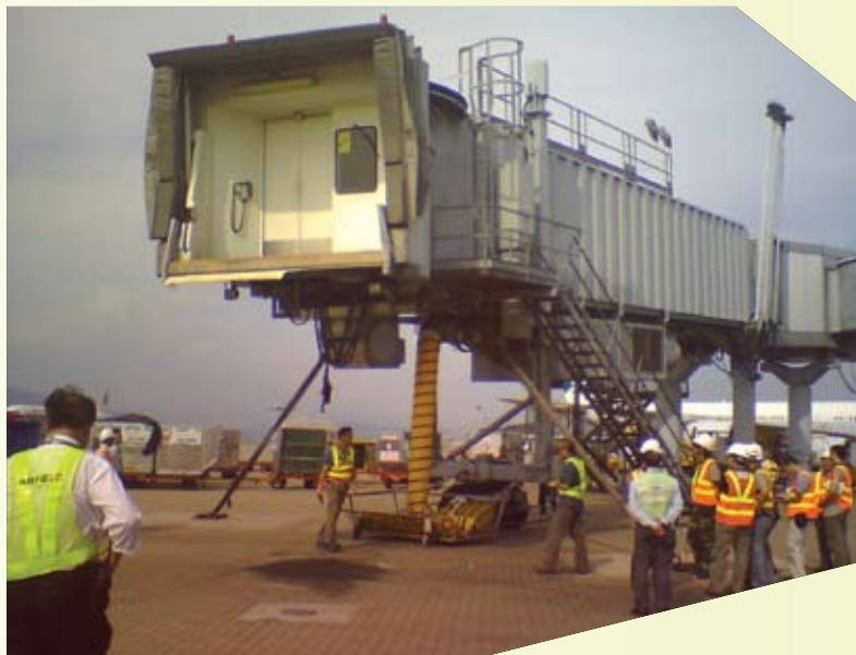
機場安全主任巡察地勤人員進行綁繫登機橋演習。 Airport Safety Officers inspecting an airbridge tie-down drill conducted by ground handling operators.

As regards future airport developments, the Division in collaboration with ATMD provided comments to the AAHK on their plans to develop the mid-field area of the HKIA to ensure smooth aircraft operation during the development stages. The Division also provided comments to the AAHK on their new initiatives to improve airfield operations such as the new markings on frontal stands for servicing equipment and, in response to the request from the industry, the new mobile aircraft engine wash equipment being considered for use at the HKIA in future.