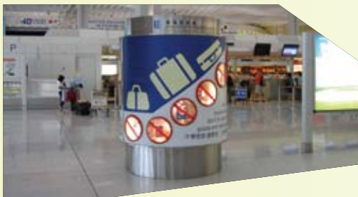
新設於香港國際機場二號客運大樓的危險品及違禁品展覽亭。 New display booth for Dangerous Goods and Restricted Articles at the Hong Kong International Airport Terminal 2.

為協助提升本港和國內航空公司、貨運代理人及付貨人的空運危險品操作水平，危險品事務組在二零零七年十二月十三日參加了由中國民航、中國東方航空、中國南方航空、國泰航空和港龍航空在廣州合辦的大中華危險品聯絡會議，又在二零零七年十二月二十九日參加了由中國電子工業標準化技術協會及中國資訊產業部在深圳主辦的鋰離子電池安全標準研討會，並在會上介紹了有關監管空運電池方面的工作。兩個會議共有超過150個位業界人士出席。