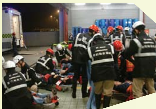
於飛機意外救援演習中，設立在消防分局的救護分流站。 Triage Point at Sub Fire Station during Annual Aircraft Crash and Rescue Exercise.

本年度的飛機意外救援演習於二零零七年十一月廿三日在消防分局附近的停機位進行，目的是測試利用消防局的掩蔽地方作救護分流站之用。另外，一輛新的喉泡車於二零零七年十一月送交機場消防隊，經測試後已於二零零八年一月投入服務。