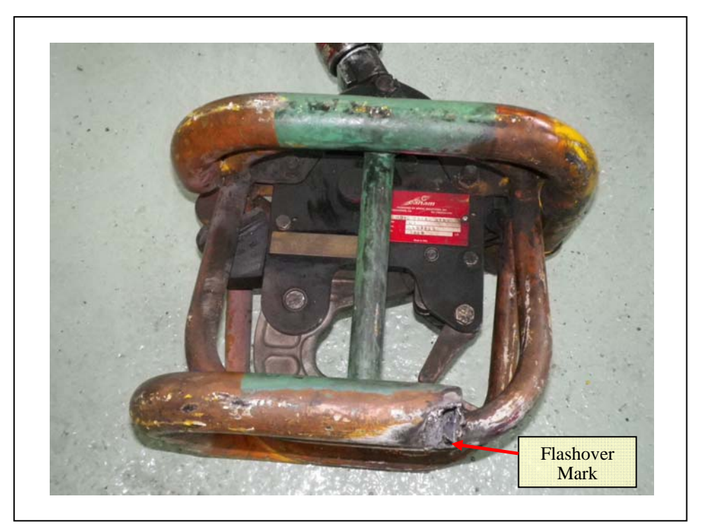
Figure 2 : The remote-controlled hook which was connected to the bottom end of the longline was charred, showing clear burn marks and signs of flashover.