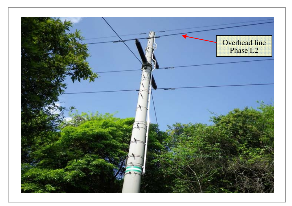
<u>Figure 3</u>: Pole 9 of the "Fanling – Ting Kok Road No. 1 132 Kilovolts Overhead Line Circuit ("FNL-TKR No. 1 Circuit")