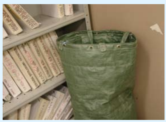
Collection points of waste paper for recycling within the office.