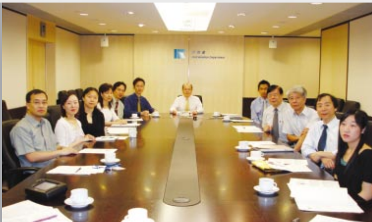
Environmental Management Committee