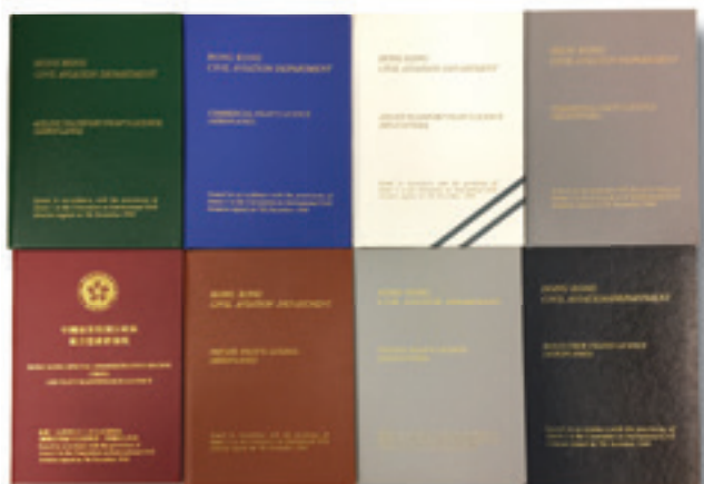
由航空人員執照事務組簽發的空勤人員執照及飛機維修執照。 Flight crew licences and aircraft maintenance licence issued by the Personnel Licensing Office.