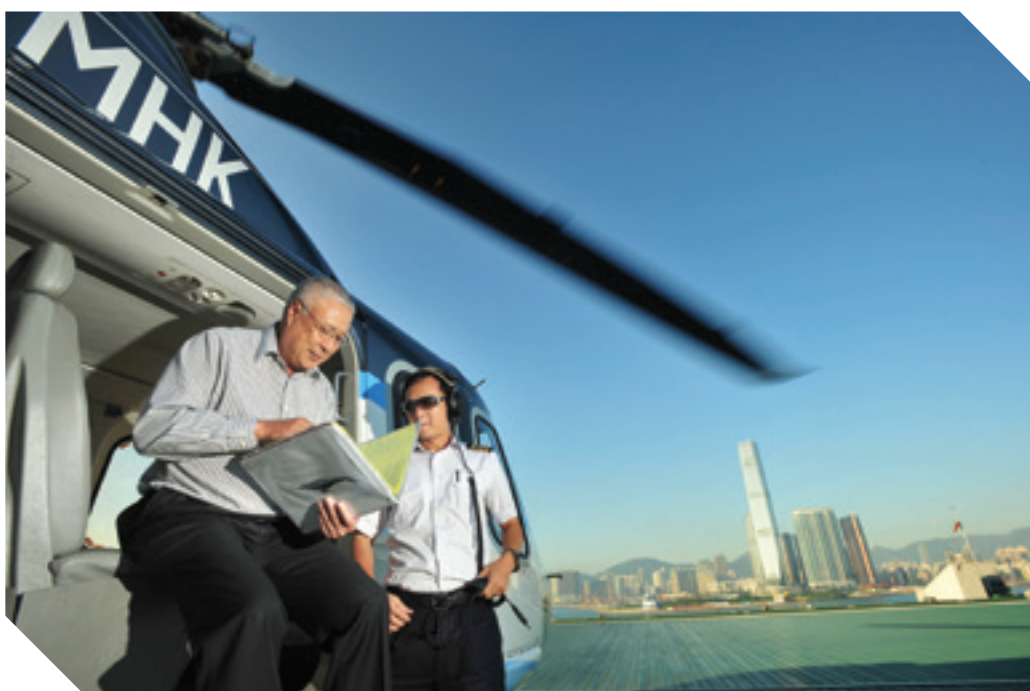
民航處人員進行直升機檢查。 CAD officer conducts an inspection on helicopter operations.

Also, a total of 821 Mandatory Occurrence Reports (MOR) from the industry were received during the year. Through close liaison with airline operators, maintenance organisations, aerodrome operator and air traffic service provider, all MORs were investigated for the purpose of enhancing aviation safety and preventing recurrence.