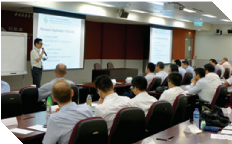
民航處人員為業內人士舉辦規例及要求的簡佈會。 CAD officer delivers a briefing to industry partners on regulations and requirements.

To maintain the technical knowledge and competence of inspecting officers in pace with the latest aviation development, the division arranged a wide spectrum of training for them on flight operations and airworthiness matters. These included training in the design and maintenance of specific types of aircraft and materials, simulator evaluation, operational approvals, auditing techniques as well as safety management. In addition, the officers participated in international and regional conferences, seminars and working group meetings to exchange and share experiences and best practices with international experts. These international events included ICAO conferences/seminars on the Remotely Piloted Aircraft Systems, Asia Pacific Regional Aviation Safety Team Meeting, Safety Management International Collaboration Group Meeting; European Aviation Safety Agency – Federal Aviation Administration International Safety Conference, Risk Based Type Certification Workshop; and Certification and Maintenance Review Board of some new aircraft types and meetings with various aviation authorities.