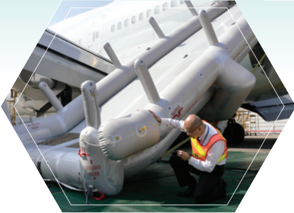
民航處人員檢查安全儀器。 CAD officer conducts an inspection on safety equipment.