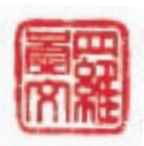
民航處處長 羅崇文太平紳士

Looking ahead, the department will face numerous challenges but as in the past, our staff will continue to perform with the high level of efficiency and deliver quality services to the community.