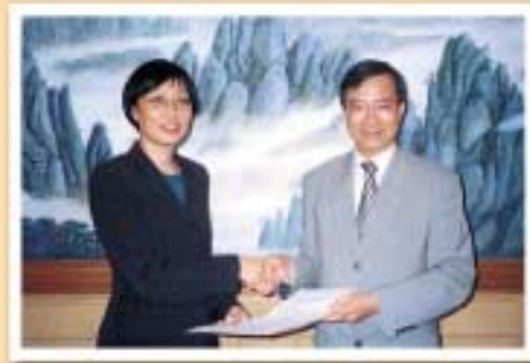
由左至右 From left to right