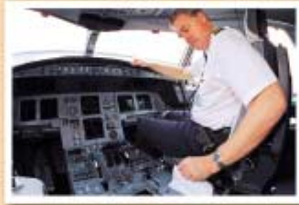
由左至右 From left to right

電子工程師進行其中一項衛星通訊、導航及監察／航空交通管理系統測試。 An electronics engineer conducts a trial operation on one of the elements of the CNS/ATM Systems.