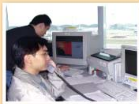
由左至右 From left to right

工程及系統部密切監察導航設備的維修情況。 Maintenance of navigational aids is closely monitored by the Division.